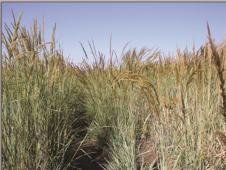
Only the best managed rangelands have significant stands of this nutritious grass.

Indiangrass, Sorghastrum nutans , is a perennial bunch grass that provides both cover and food for wildlife, and a valuable range indicator. It is a decreaser, meaning that with heavy grazing pressure it will decline. Only the best managed rangelands have significant stands of this nutritious grass. Indiangrass along with big bluestem ( Andropogon gerardii ), little bluestem ( Schizachyrium scoparium ) and switchgrass ( Panicum virgatum ) make up the four major grasses once found in the Tallgrass prairie that covered the central United States. Indiangrass will grow in a variety of soils including sandy and gravely disturbed sites but thrives best in rich bottomland areas with adequate moisture ranging from Canada to Mexico. It will survive periodic flooding but not prolonged saturation and thrives after being burned. The active growing period for this warm season grass starts in mid-spring, end of March to early May here in Texas. All warm season grasses like for the soil temperatures to be above 50 degrees Fahrenheit before germinating. It also makes a wonderful accent or ornamental grass for home landscaping. The clump will grow to about 1 ft in diameter and the blue green foliage remains about 3-4 ft until the fall when seed heads will shoot up. The plume-like seed heads have a metallic golden sheen sometimes turning a bronze color. These beautiful seed heads mature between September and November and make a stunning fall accent.