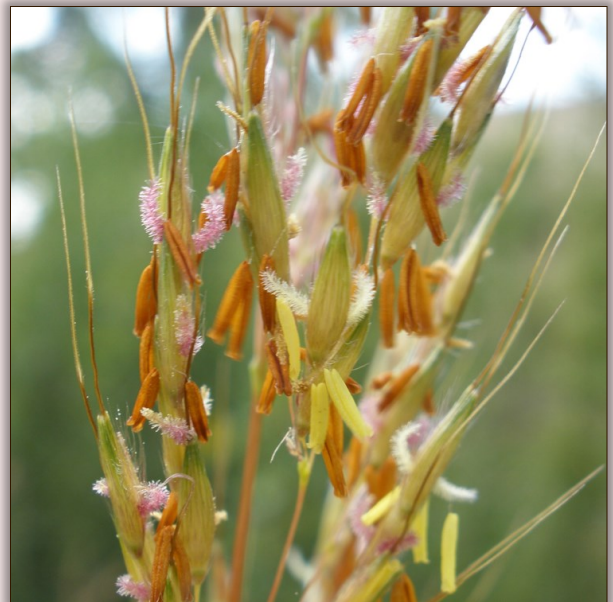
Indiangrass seed heads mature between Sept-Nov and make a stunning fall accent.